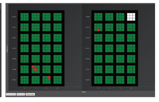
Real-time Process Monitoring